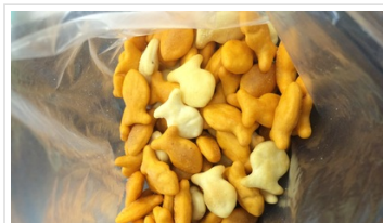
Picture 1: This is an example of a sample of fish caught. Shown are 17 untagged fish and only 5 tagged fish. This sample is on the larger side of most of our group's catches.